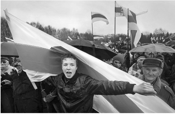
Freedom Day in Minsk on the 94th anniversary of the proclamation of the Belarusian People's Republic. 25 March 2012.