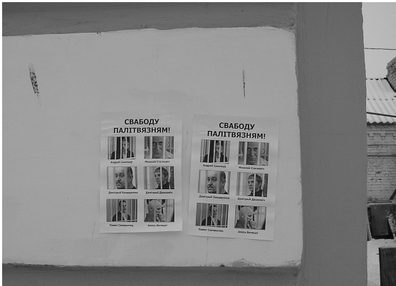
Solidarity with political prisoners in Orsha, Slonim and Polatsk. 2012.