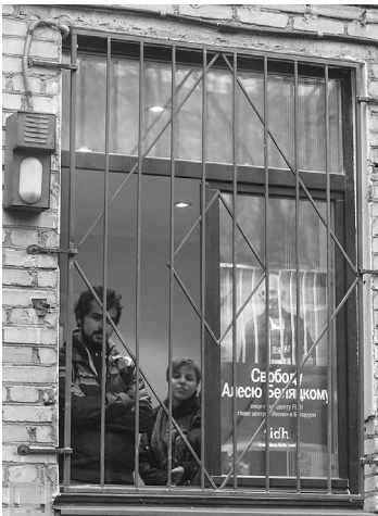
Confiscation of the office of the Human Rights Center «Viasna. Minsk, Nezalezhnasts Avenue, 78A-48, 26 November 2012.