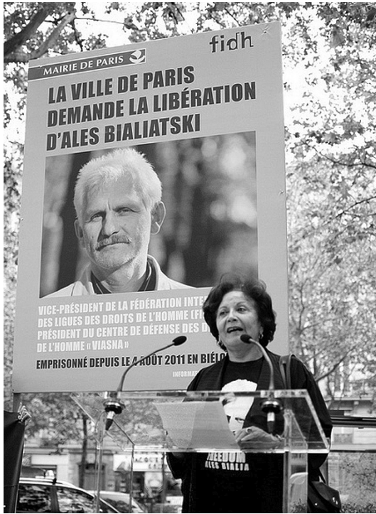
FIDH President Souhayr Belhassen during the installation of a portrait of the imprisoned human rights defender Ales Bialiatiski in front of the Mayor's Office of the 11th arrondissement of Paris. 11 May 2012.