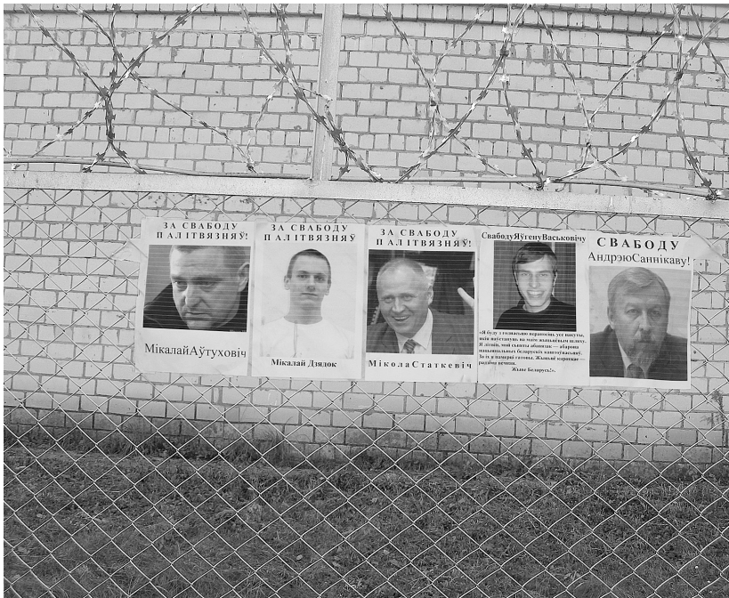
Solidarity with political prisoners. Babruisk.