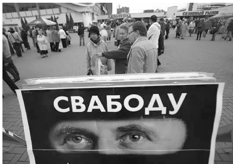
Solidarity with Mikalai Statkevich. The square in front of Kamarouski market in Minsk, 22 September 2012.