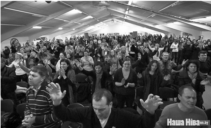
Parishioners of «New Life» holding everyday prayers for saving their temple. Minsk, 29 November 2012.