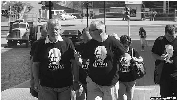
Human rights defenders heading for the Presidential Administration to pass a petition demanding to release Ales Bialiatiski and all political prisoners. Minsk, 3 August 2012.