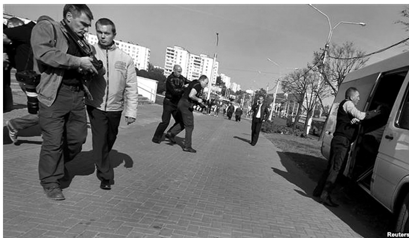
Detention of journalists while performing their professional duties. Action of the youth organization «Zmena» near «Frunzenski» department store in Minsk. 18 September 2012.