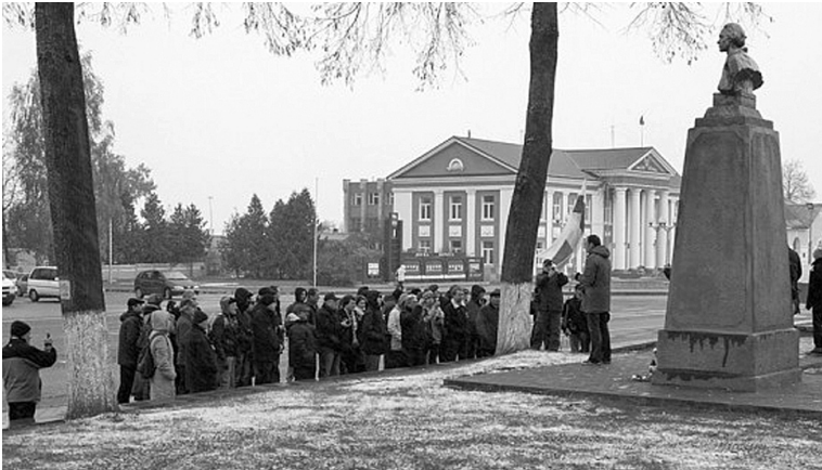
Annual event in the memory of the insurgents of 1863 in Svislach. 27 October 2012.