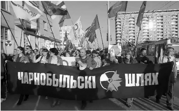
Chernobyl Way 2012. Minsk, 26 April 2012.