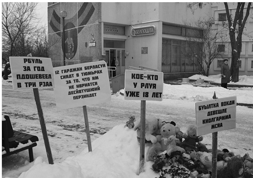
Toy protests — a wide-spread form of protest actions during the year. The photographed action was organized by the youth wing of the civil campaign «Tell the Truth» — «Zmena» on the Universal Day of Human Rights in front of the National Library. Minsk, 10 December 2012.