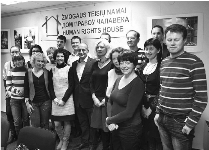
Meeting of Belarusian human rights defenders with the UN Special Rapporteur on Belarus Miklosz Haraszti. Vilnius, 12-13 November 2012.