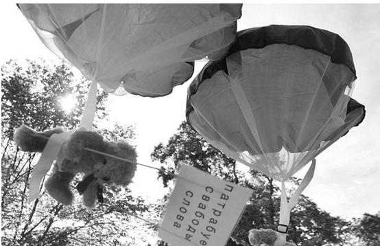
A group of Swedish citizens has conducted a risky and brave action in support of the Belarusian freedom fighters. 3 July 2012.